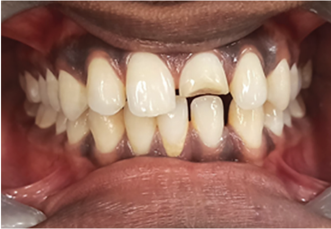
Fig. 1: Preoperative photograph

After the administration of local anesthesia (lignocaine hydrochloride 2% with adrenaline 1:100,000), rubber dam application was done, and the crown was disinfected with 5% sodium hypochlorite (Fig. 2). The roof of the pulp chamber was removed by using a coarse, high-speed diamond bur. After pulp exposure, the cavity was flushed with 2.5% sodium hypochlorite. Partial removal of pulp was done. Hemostasis was achieved by the application of a cotton pellet moistened with 2.5% sodium hypochlorite for up to a maximum of 10 minutes (Fig. 3). Biodentin was mixed and placed over the exposed pulpal tissue (Fig. 4). Then a layer of resin-modified glass ionomer (RMGIC) was placed over the material and light-cured for 20 seconds. Finally, a composite restoration was given over the RMGIC. Maxillary and mandibular impressions were taken for wax buildup. Polyvinyl siloxane putty index was made (Fig. 5) and composite buildup was done (Fig. 6).