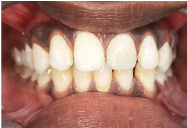
Fig. 6: Postoperative photograph

A tooth that became symptomatic with or without radiographic signs of periapical pathology, root resorption, or asymptomatic with radiographic signs of periapical pathology followed up over a period of 12 months will be considered as failure.