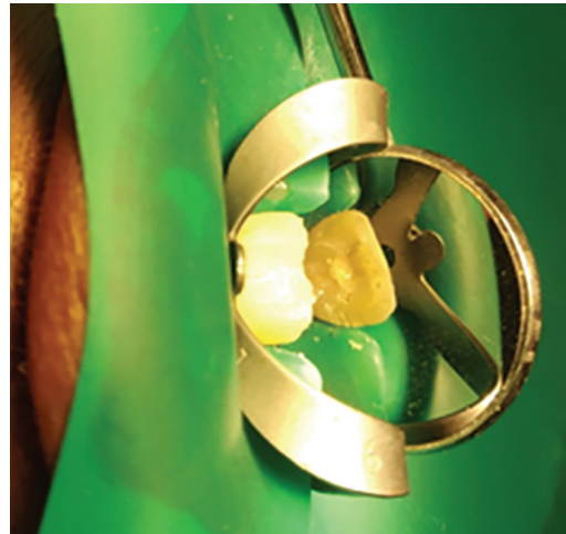
Fig. 4: Biodentin placement