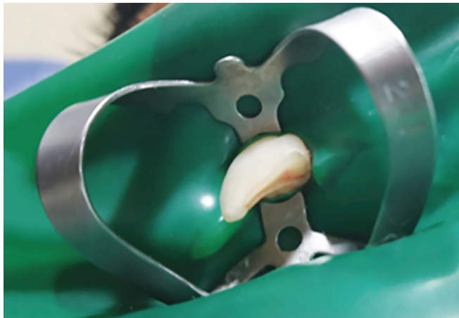
Fig. 2: Rubberdam placement