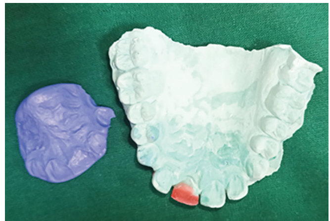
Fig. 5: Polyvinyl siloxane impression