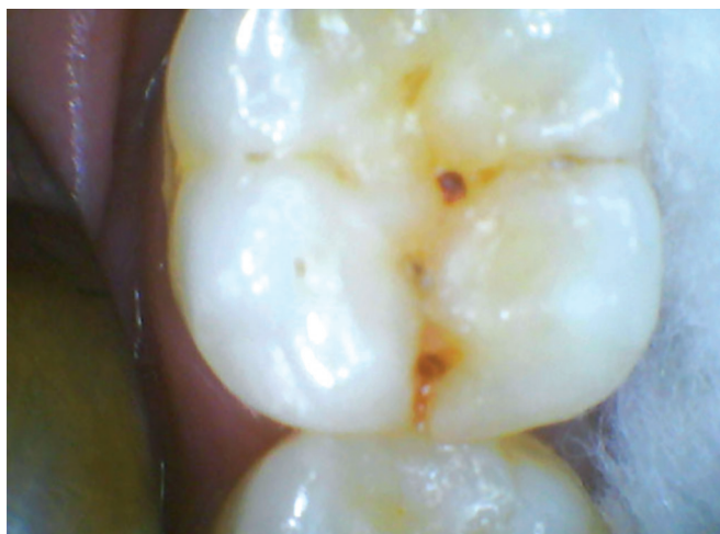
Fig. 1: Occlusal aspect of mandibular first molar showing mesial crack

A cracked tooth has an incomplete crack originating coronally and extending cervically (Fig. 1). They occur commonly in mandibular molars. 4 The crack is usually centrally located and can cross one or both marginal ridges and may extend into the proximal surfaces. 1 These cracks are usually present mesiodistally. However, Seo et al 7 have reported that cracks can also occur buccolingually or can be both in the mesiodistal and in the buccolingual directions. Similarly, Roh and Lee 8 have reported that the most common direction of cracks was mesiodistal but cracks can also occur in the buccolingual direction or in both directions. They may occur in intact teeth 4 or in restored teeth where they are seen in the unrestored part of the tooth or in the cavity floor after removal of the restoration or both. They can be identified by staining and transillumination. However, early identification may be difficult. Pain on mastication can be present. According to Seo et al, 7 the bite test is the most reliable for identifying a cracked tooth. If the crack involves the pulp, pulpal pathology and symptoms